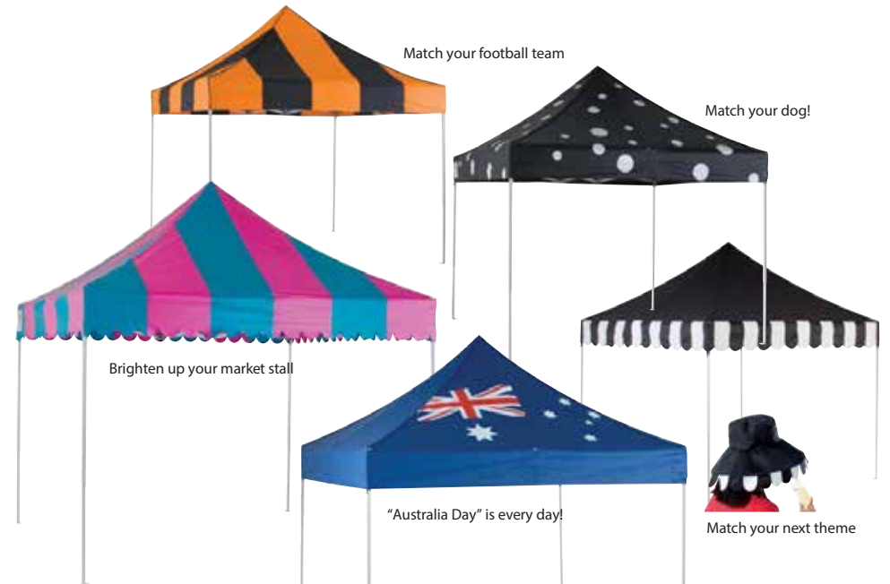
Match your football team