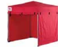
REAR AND SIDE WALLS