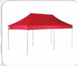
6.0m x 3.0m LWS/PRO