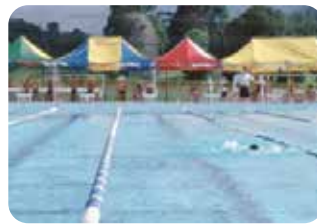
SCHOOL SPORTING ACTIVITIES