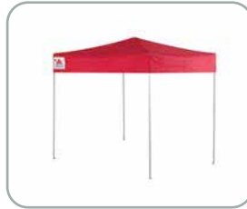
2.1m x 2.1m PRO