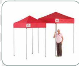
1.8m x 1.8m PRO