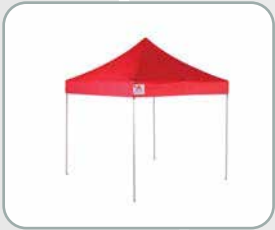
2.4m x 2.4m LWS/PRO/STUMPY