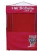
1/2 WALLS AND POCKETS FOR POSTERS

Awnings add extra shade, protecting your stock and customers alike. Extra legs are also available to reduce flapping of walls on those extra windy days, whilst sand bags add stability.