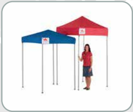
1.5m x 1.5m LWS