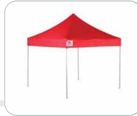
3.0m x 3.0m PRO