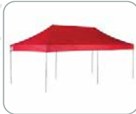
7.2m x 3.6m PRO