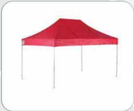
4.5m x 3.0m PRO