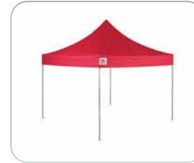
3.6m x 3.6m PRO