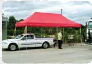
PROTECTION OF WORKERS