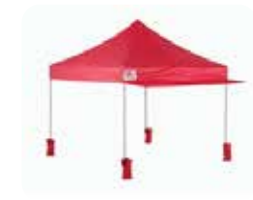
AWNING/S AND SAND BAGS