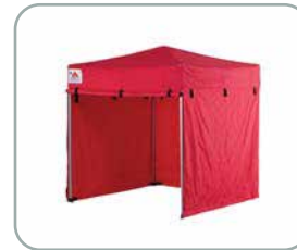
2.1m x 2.1m PRO "I.P." - Instant Privacy tent