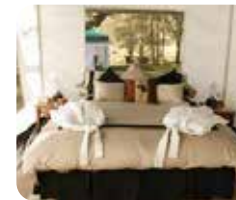
MESH WALLS - IDEAL FOR CAMPING